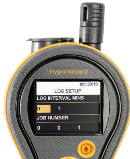
Set interval 1 minute to 24 hours